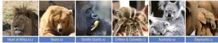
Heart of Africa A2.3 Bears A2 Gentle Giants A2 Critters & Cobwebs C2 Australia A2 Elephants C2

Our new Zoo Loop was created to make your experience at our Zoological Gardens more fun, more exciting and much easier. Simply follow the teal coloured line on the map, as well as the signage throughout the Zoo. Should you veer off the route, simply follow the clearly marked signs back to the teal Zoo Loop ! Enjoy yourself!